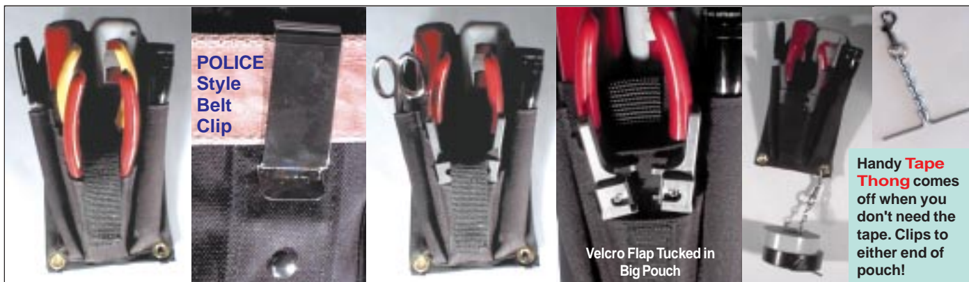
POLICE Style Belt Clip